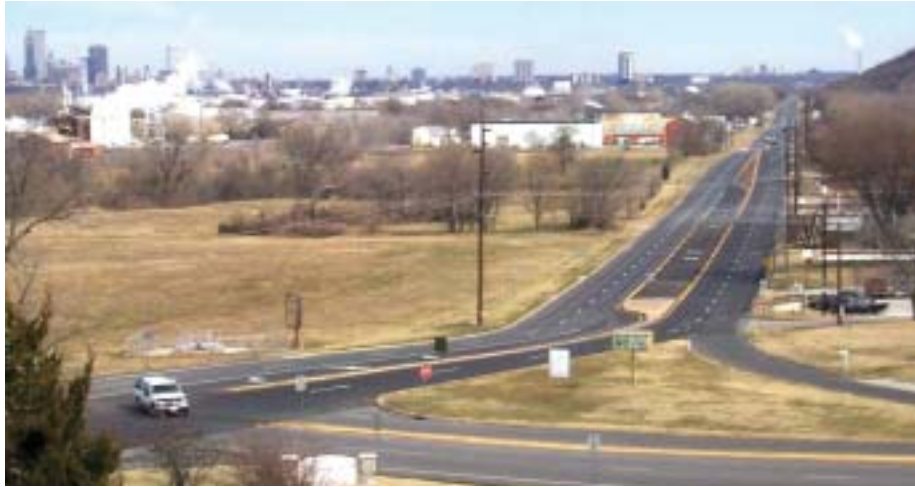
Resurfacing of West 21st Street is complete.

Key roadway projects are nearing the construction phase as plans are completed, utilities are re-located and projects are readied for bid. Beginning this winter and into spring, significant roadway work will take place in all three Commission Districts. Look on the map to find the projects in your area.