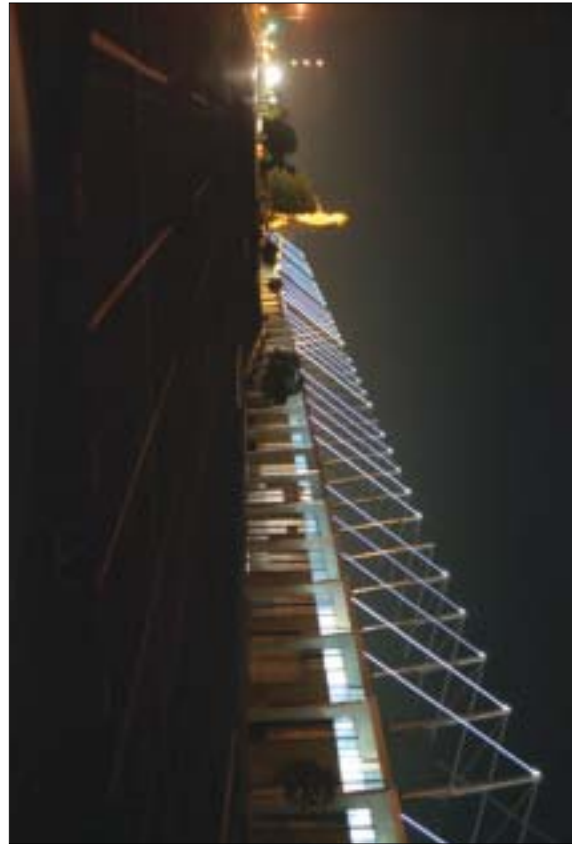
The new fiber optic lighting show at Expo Square viewed from 21st Street.