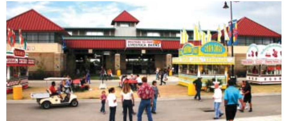
New Barns "A" and "B" during the Tulsa State Fair