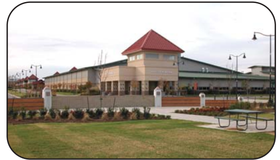
Expo Square's Livestock Arena and new Central Park

Because of your support of the Vision 2025 package, we are now turning our efforts to further improvements that undoubtedly will make Expo Square into a world class facility. We are currently meeting with user groups and the project architect to develop plans with a hope of beginning many of those projects within the year. Thank you again for your support and do not hesitate to call, write, or e-mail us with your thoughts and ideas for the future.”