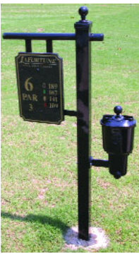
Call 596-8627 to Check the Opening Date

The much anticipated "new" LaFortune Championship Golf Course is almost completed. All new greens, tees, bunkers, water features, cart paths, expanded practice areas, ball wash facility, event pavilion, and an increased level of maintenance will be combined to reward area golfers with the rejuvenation of this classic course. The Grand Reopening for the course is scheduled for early summer.