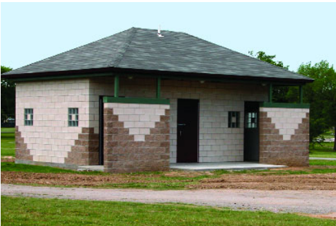
One of Two Newly Constructed Restroom Buildings at O'Brien Park

Two new and much needed restroom buildings have been built in the park to replace the old buildings. In addition, the restrooms inside the Recreation Center have been reconstructed and remodeled. These facilities are fully accessible. The Center's restrooms also can accommodate extra-wide sport chairs used by the wheelchair basketball league. O'Brien has been home court to the league since the mid-1970's. Included in previous Recreation Center improvements are an upgraded air conditioning system, a new scoreboard, and new backboards. Come see what "4 to Fix" has done for O'Brien Park!