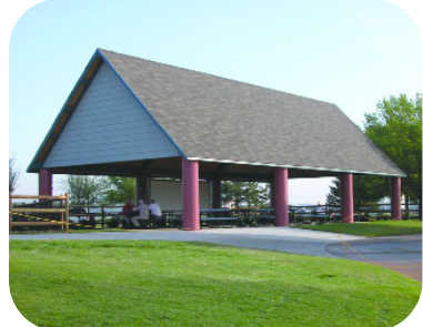
New South Lakes Pavilion

South Lakes Golf Course The new Pavilion opened in May and has already hosted the State 5A High School Girls' East Regional Golf Tournament. Sixteen high school teams competed.