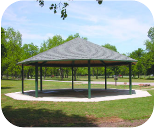
Two New Picnic Pavilions

Haikey Creek Park Pavilions Just in time for spring, we have new picnic pavilions! Tables and benches are coming soon. Come enjoy them!