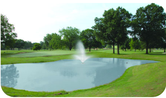
An Exciting New Look for LaFortune Golf

Presort Std. U.S. Postage PAID Tulsa, OK Permit #1472